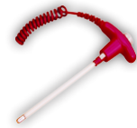
Part Number: TP - RCT - PB4