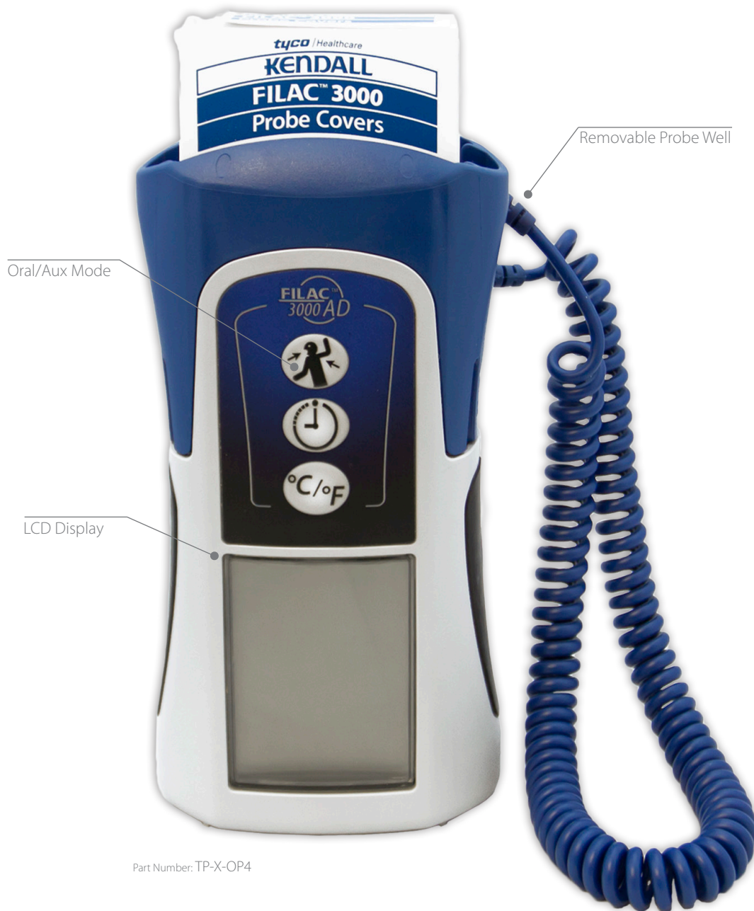
Part Number: TP-X-OP4