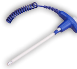
Part Number: TP - ORL - PB4