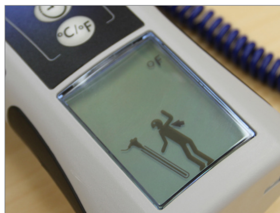
Predictive Thermometry LCD Screen

Minimizing cross contamination is made a priority with touchless loading and ejecting of the single use probe covers. A full swap, including probe covers, occurs when converting between oral/axillary and rectal measurements, further protecting against possible infection.